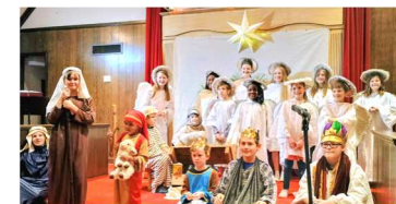
"THANK YOU" to all our choir leaders & helpers!!