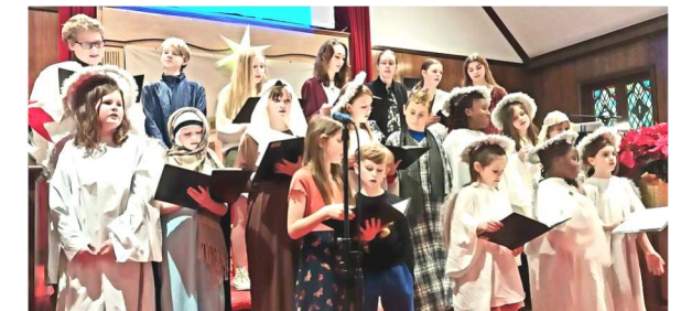
Youth Choir at Christmas Eve